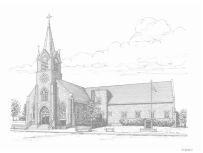
Come to Faith, Honor God's Word http://www.fontanellelutheran.org

NON-PROFIT ORG. U.S. POSTAGE PAID FONTANELLE, IOWA PERMIT NO. 10