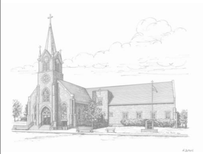
Come to Faith, Honor God's Word http://www.fontanellelutheran.org

NON-PROFIT ORG. U.S. POSTAGE PAID FONTANELLE, IOWA PERMIT NO. 10